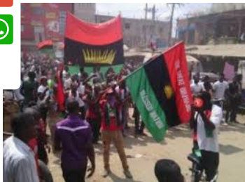
Oyiibo Local Government Area of Rivers State.

ABIA / NATIONAL / 2 KILLED, SCORES WOUNDED AS SOLDIERS, IPOB CLASH IN RIVERS