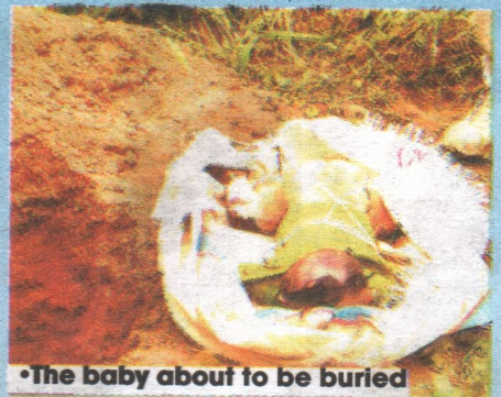
•The baby about to be buried

"I didn't tell anybody that I had killed my baby. If anybody asked me about my baby, I would lie that she was sleeping. But when people who know me didn't see the baby after sometime, they reported to the chief of the community about their observation. He in turn informed the police.