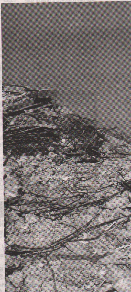
• The collapsed building site yesterday.

A source told the reporter that one of the 13 rescued persons died at the hospital.