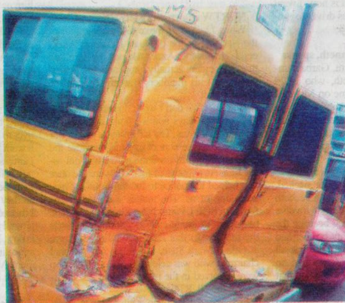
The LT bus

he became unconscious. Rather than leave him to his fate, they felt that if he died, they could be implicated and in order to cover up their crime, they threw him into the lagoon, thinking that nobody would find out what actually happened. Having thrown him into the Lagoon, they all ran away, including the LT bus driver, who ran straight to a panel beating shop, where he instructed them to start repair work on his bus immediately."