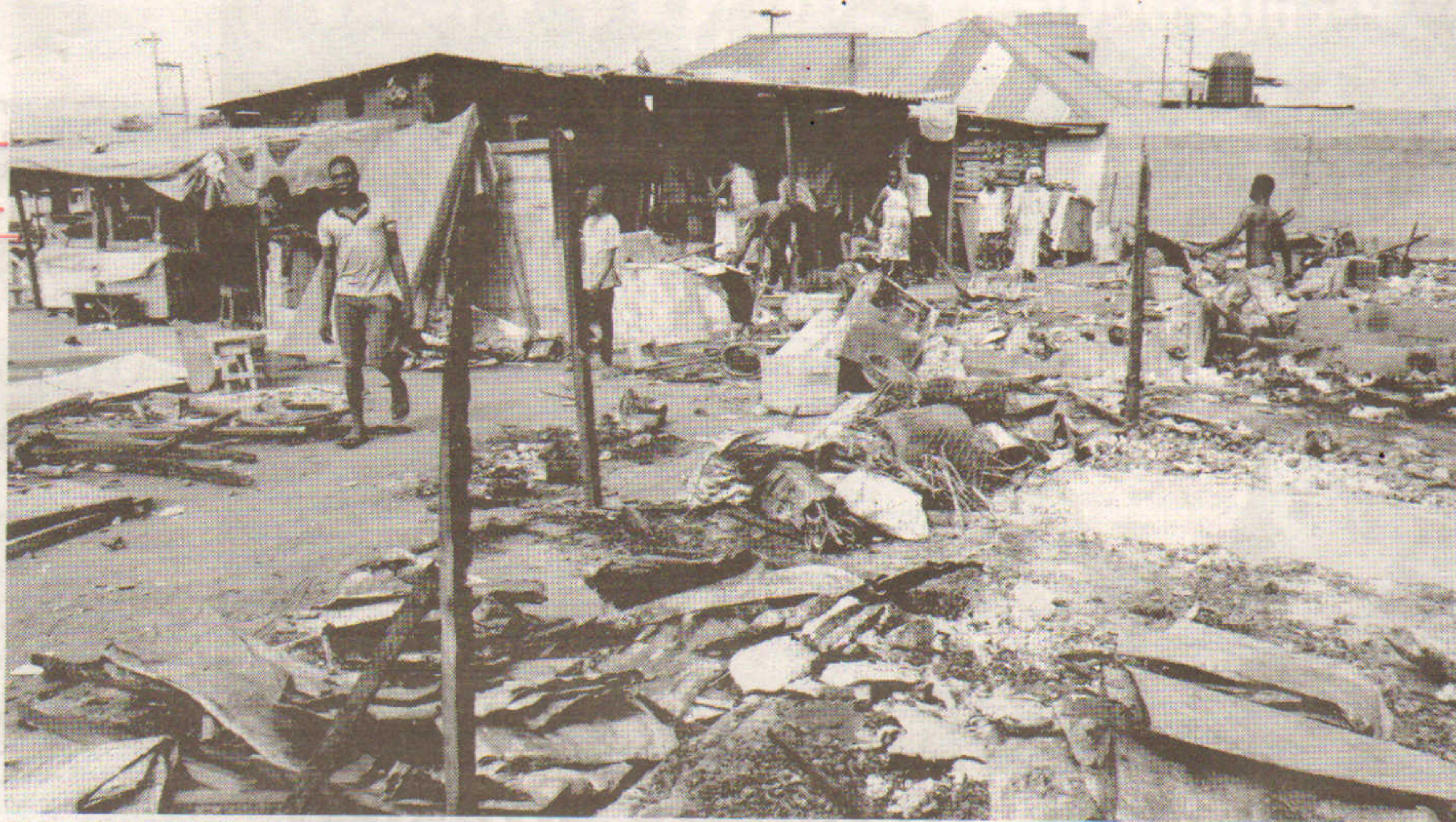
The battlefield after the mayhem

"Well, what happened this time around is that we were not happy with our men that we lost in the previous fight. Some of our members who were injured during the attack felt that they would have died just like Wasiu and Ibadan. So, after