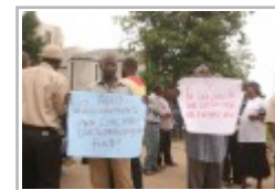
In Pictures: PHCN Protest Unpaid Salaries