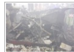
In Pictures: Scene of DANA Air Craft In Lagos