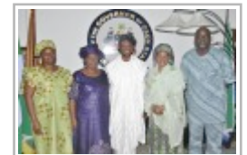
Aregbesola hosts Awolowo descendants