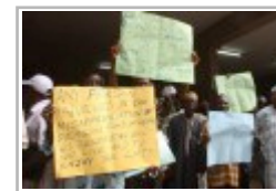
In Pictures: Pensioners Protest Over Unpaid Monthly Pension