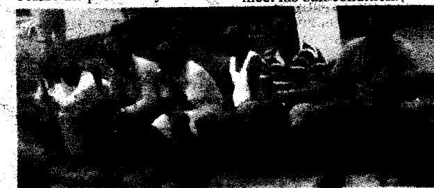
•The robbery suspects being paraded at the police station

But Umoh confirmed that the suspects would be presented before the press today.