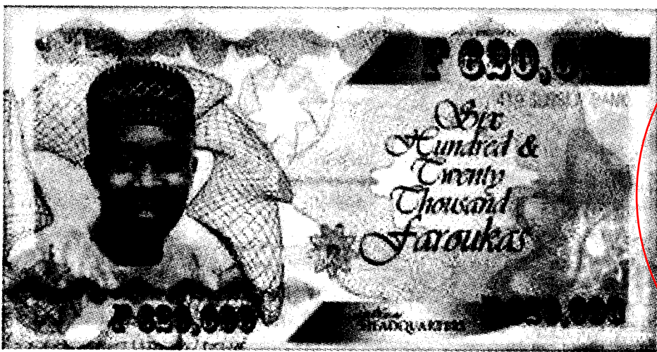
•Faroukas: The new currency on Facebook.