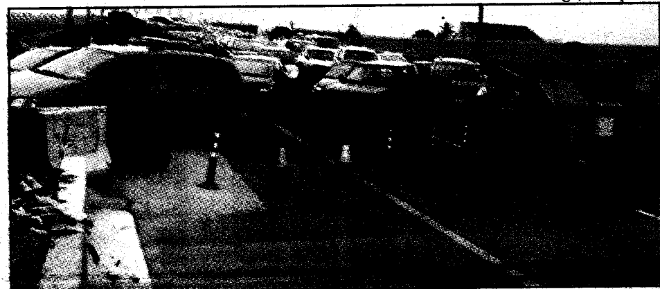
•Closed 3rd Mainland Bridge this morning.