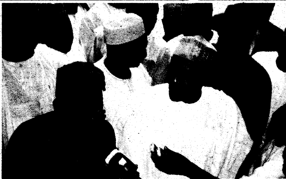
•Former Governor of Lagos State and ACN leader Asiwaju Bola Ahmed Tinubu (l) fielding question from journalists and former military Head of State, General Muhammadu Buhari, CPC Presidential candidate in April 2011 election, at a meeting in Buhari's residence in Kaduna, yesterday.

Now, sources said, the two groupings have seen the need to bridge differences and make the merger work this time around.