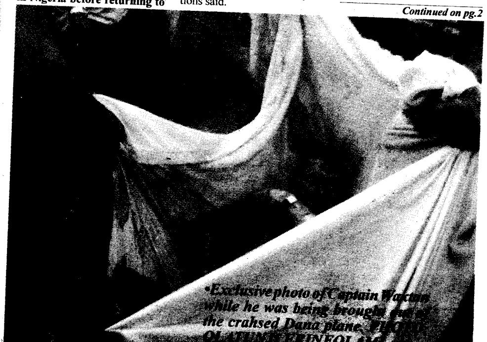
•Exclusive photo of Captain Waxtan while he was being brought out of the crashed Dana plane.