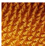
Fashola Urges Nigerians To