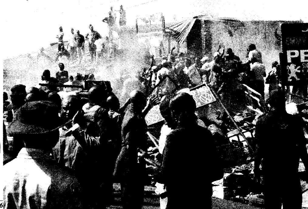
•Scene of the blast in Kaduna

FEMI ADI/Kaduna After yesterday's bomb blast that killed 14 persons and injured several others at Ogbomoso, by Katsina Road, Kaduna, Kaduna State, Northwest Nigeria, the survivors have started counting their losses. The bomb blast, according to witnesses was carried out by two suspected bombers alleged to be members of the dreaded Continued on pg.6