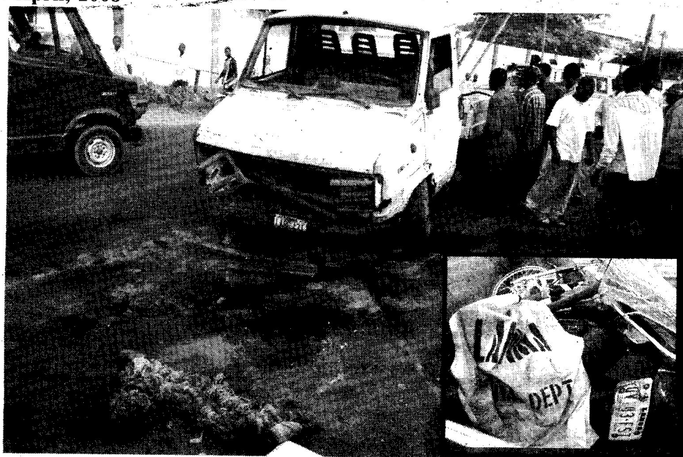
The scene of an accident involving a Lagos State government truck with registration number LA 86A 31 and a commercial motorcycle this morning opposite Daily Times in Agidingbi, Ikeja. Inset: The crushed motorcycle.

After they were arrested, they also confessed to series of similar operation and robbing bank customers in various banks in