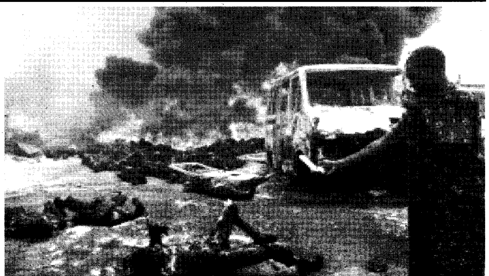
•An onlooker using camera phone to take photographs of charred bodies at the scene of pipeline fire that burnt many people to death at Abule Egba, Lagos, recently.