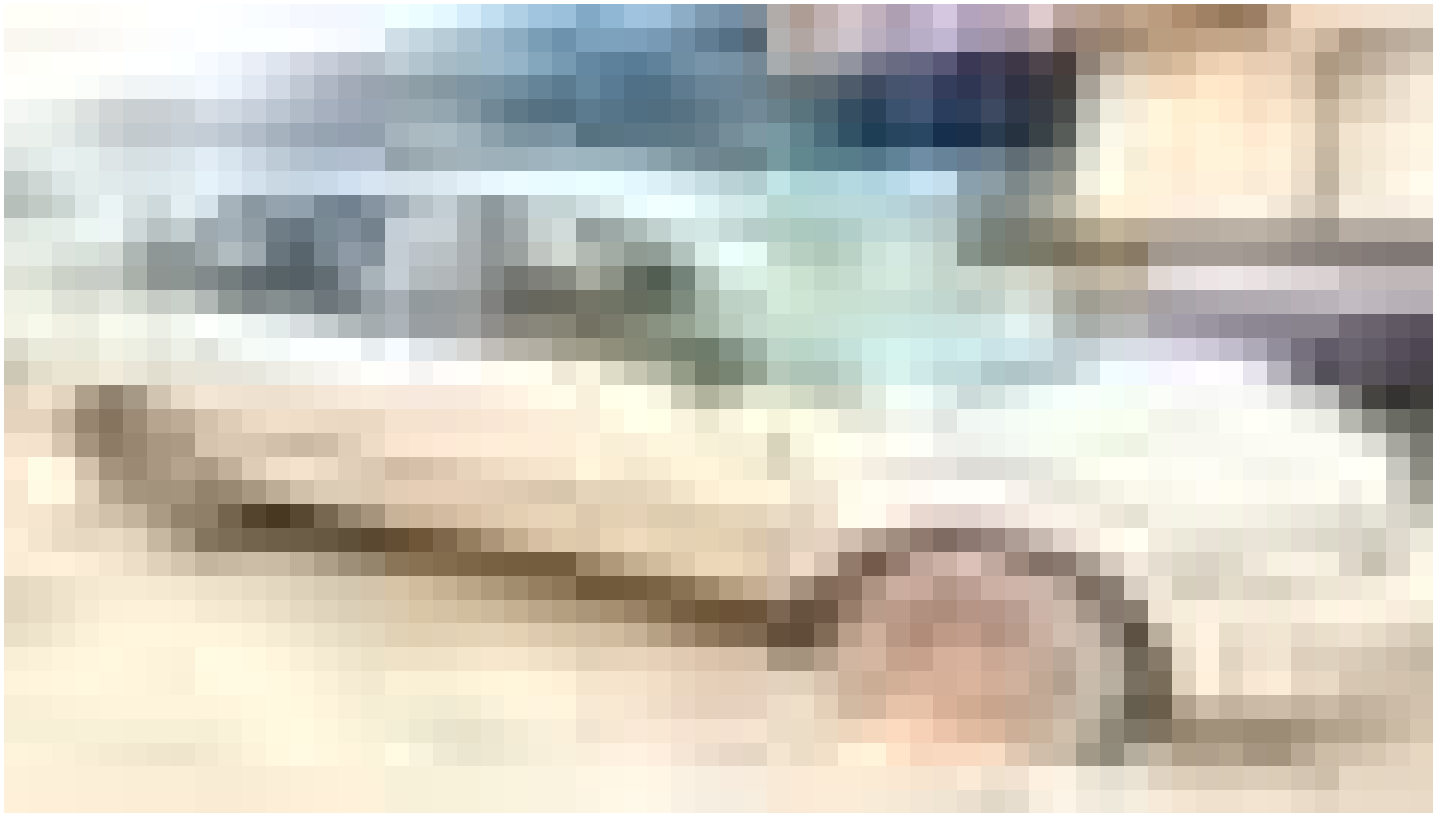
One of the damaged vehicle