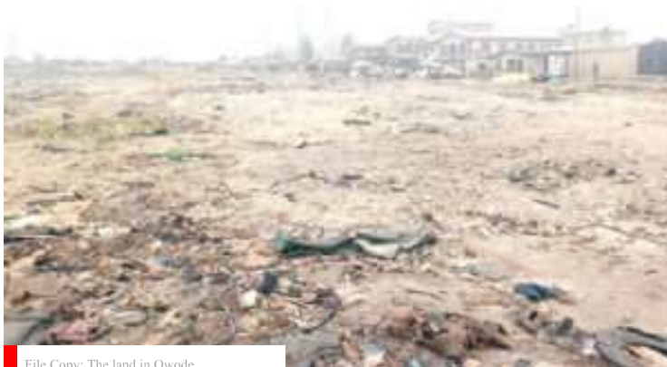
File Copy: The land in Owode