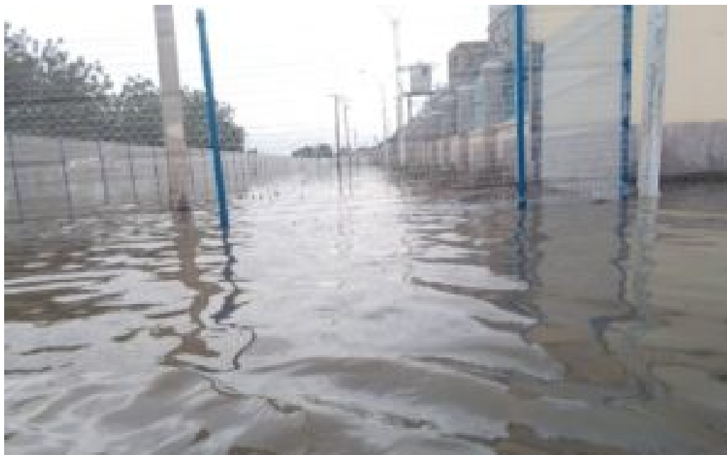
Scene of the flood at Borno street.