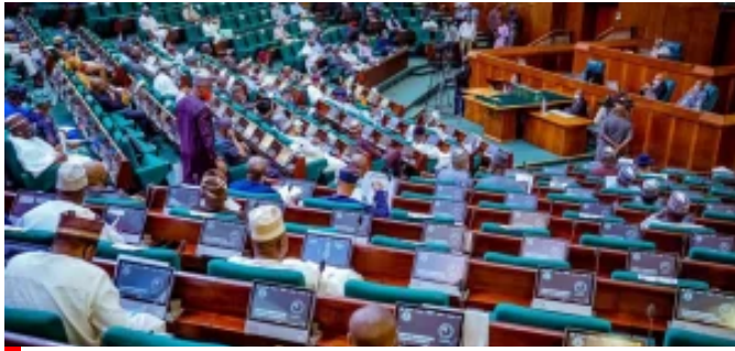
House of Reps