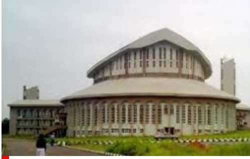
Catholic Diocese of Awka