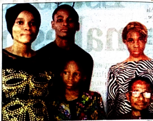
•The deceased's family

Thus, the court has discretion whether or not