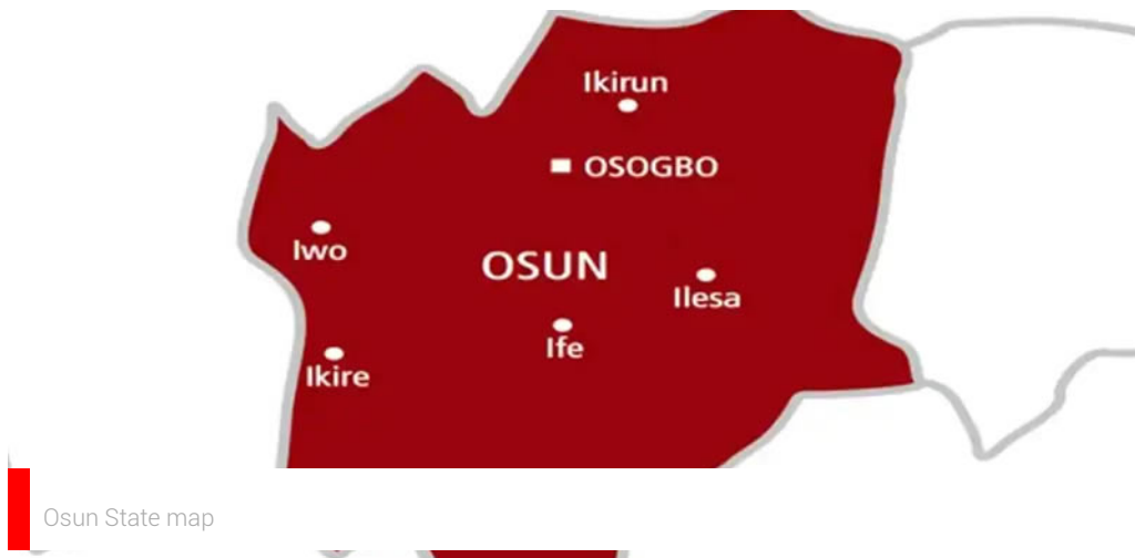
Osun State map