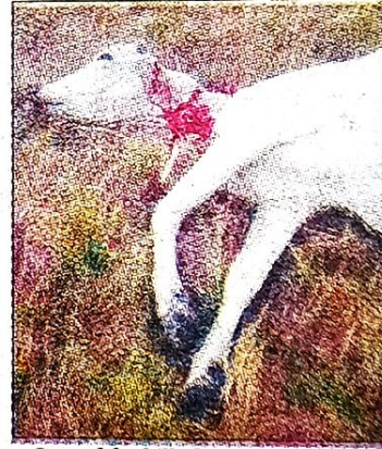
• One of the killed cows

"No government official has come to sympathise with us. We