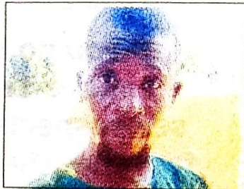
• A community leader annually.

"No government official has come to sympathise with us. We