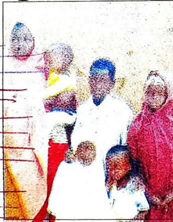
• Slain Abubakar's family members

Arewa PUNCH reports that the issue of farmers-herders conflict is not unique to Wajari. Residents of Kwami LGA, particularly Bojude village, also reported similar incidents, which they claimed occur