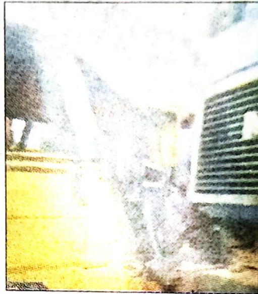
•Scene of the accident