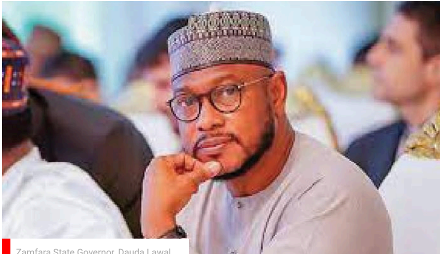
Zamfara State Governor, Dauda Lawal