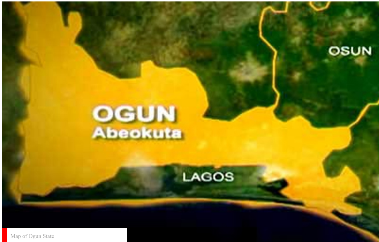
Map of Ogun State