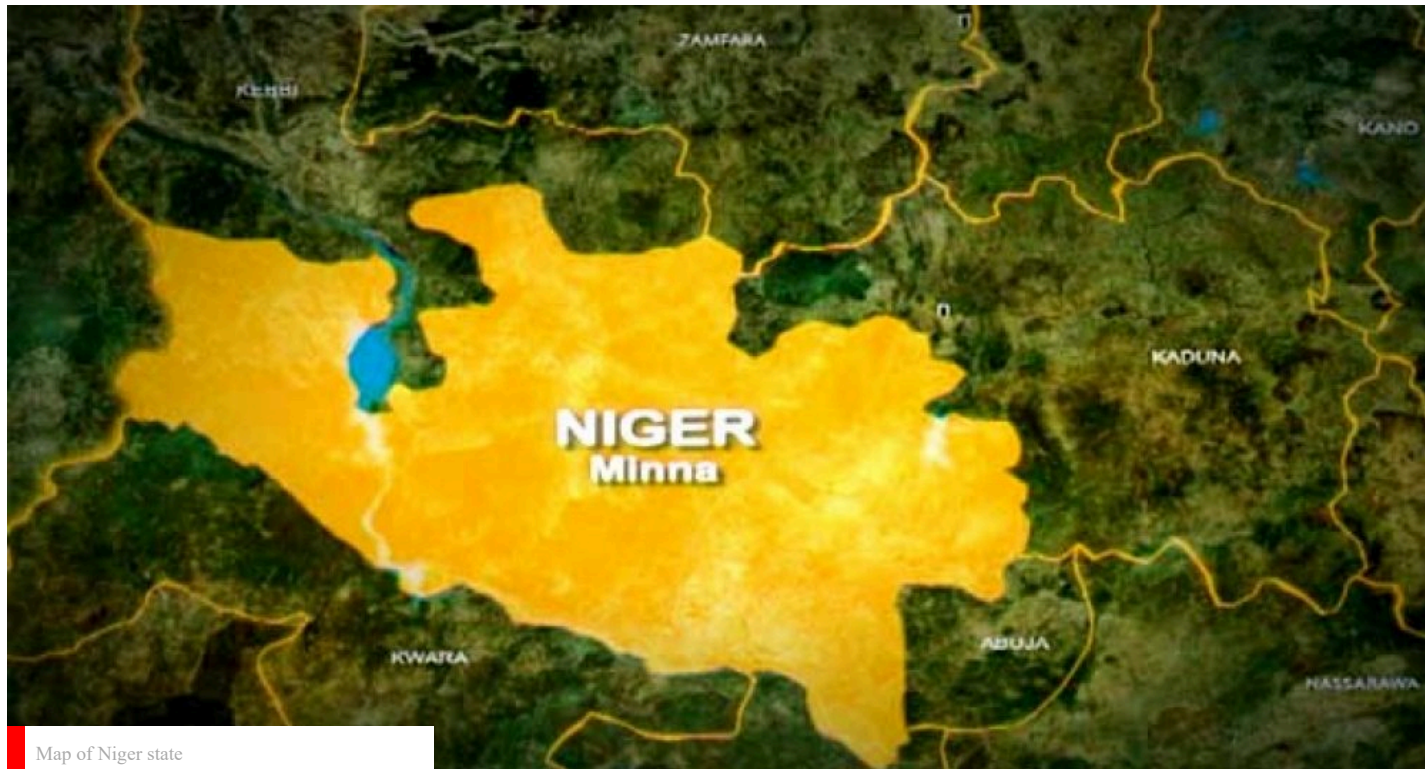
Map of Niger state