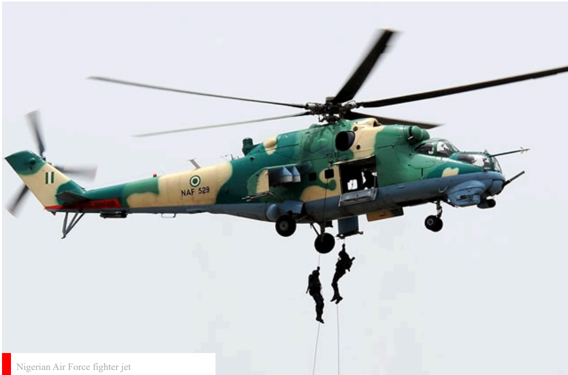
Nigerian Air Force fighter jet