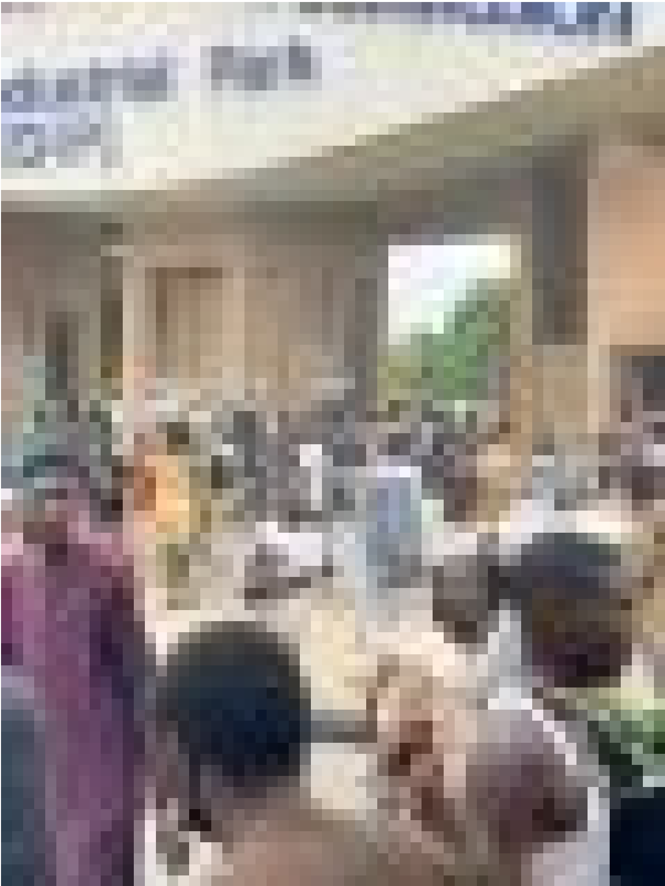
Hoodlums loot the NCC Industrial Park in Kano State on Thursday.

“They (organisers) picked us up and said they would give us N5,000 to protest against these people. I have collected N2,000 and I am waiting for my balance. I am hungry but the money given to him would not solve my problem,” he