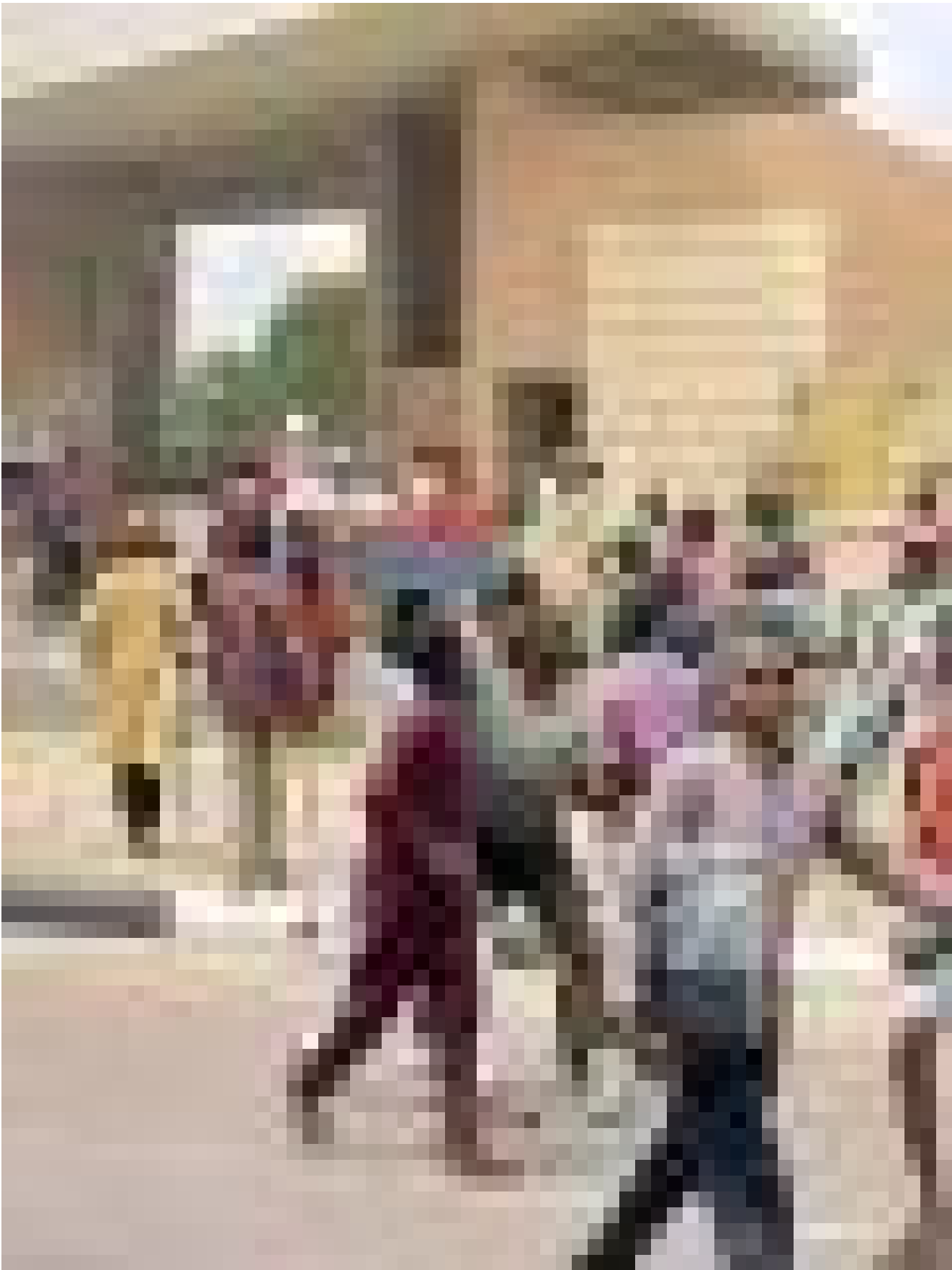
Hoodlums loot the NCC Industrial Park in Kano State on Thursday.

They, however, resisted the police directive to hold their rally inside the stadium.