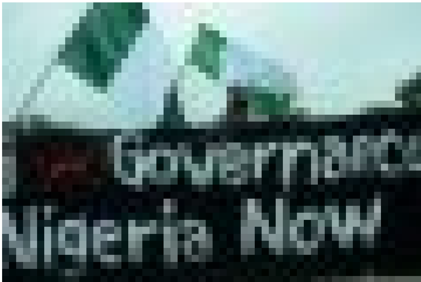
#EndBadGovernanceInNigeria protesters in Abuja on Thursday, August 1, 2024.

In response, the security operatives fired a couple of teargas canisters to discourage the protesters, who only shouted back in defiance.