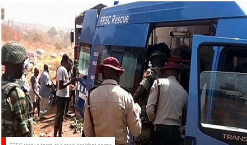
FRSC rescue team at a road accident scene