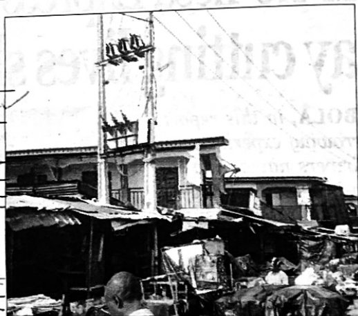
• The scene