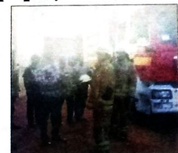
•Gombe fire incident