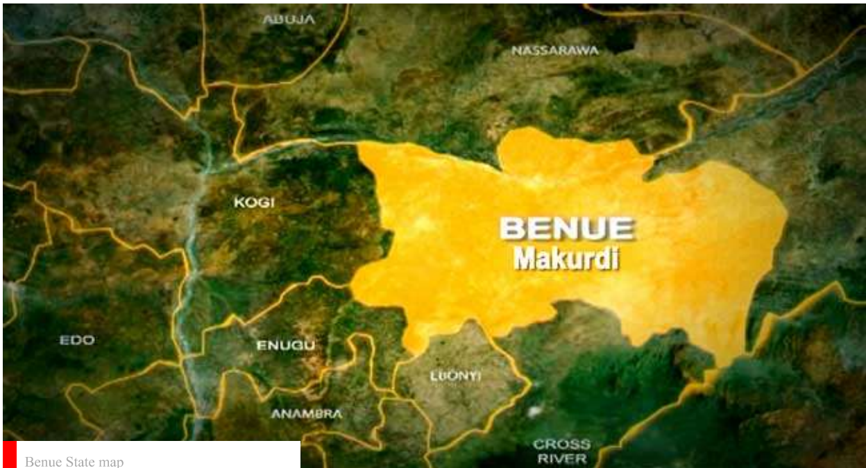
Benue State map