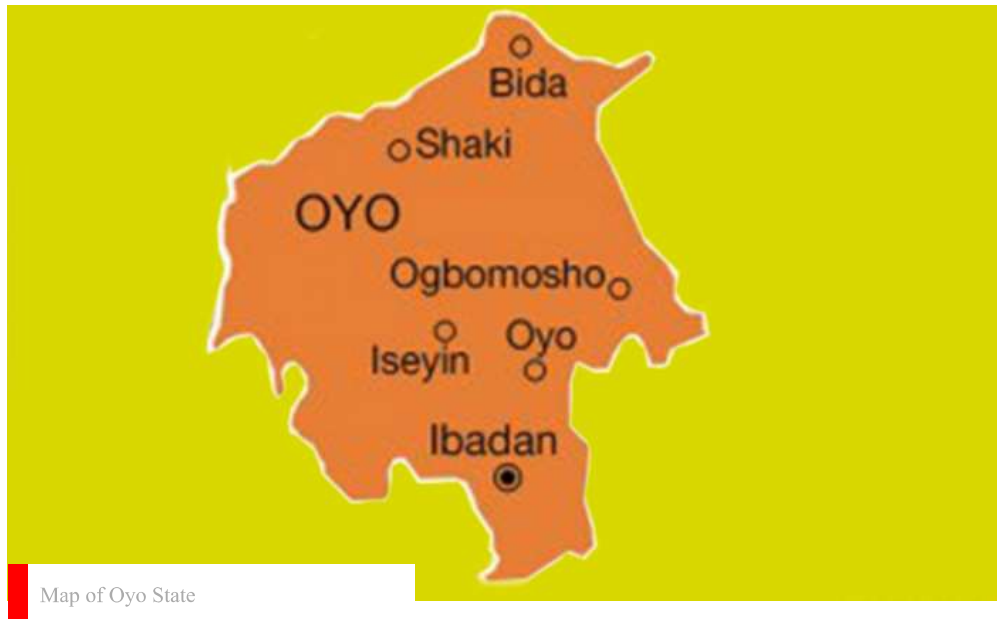
Map of Oyo State