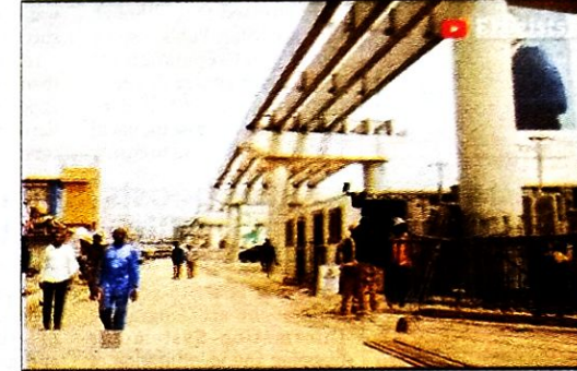
•The Ikeja flyover under construction

They noted that a portion of the road had been blocked