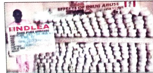
• Some of the items seized by NDLEA officials.