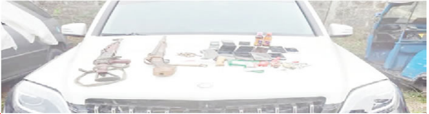
The suspects and exhibits