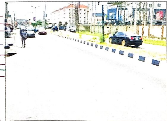
• Admiralty Road