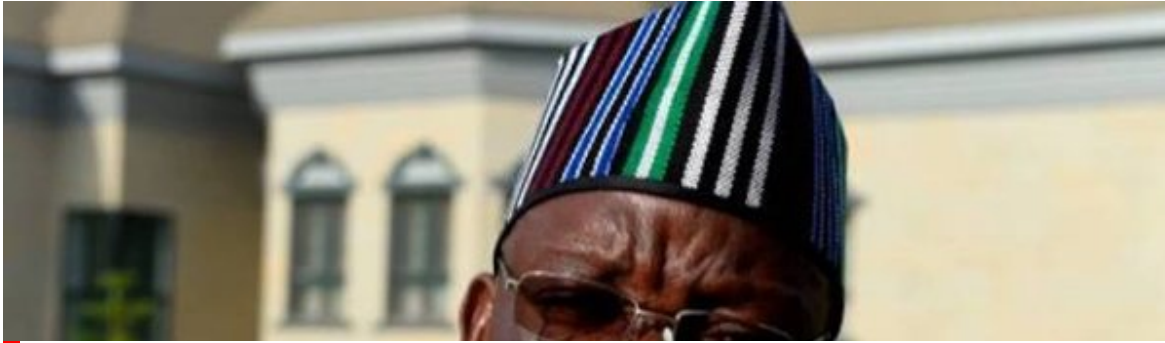
Benue State Governor, Samuel Ortom