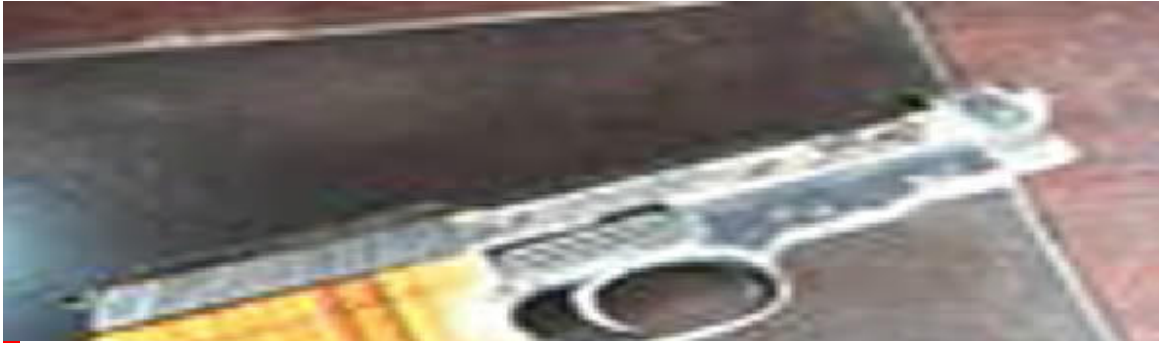
The recovered weapon