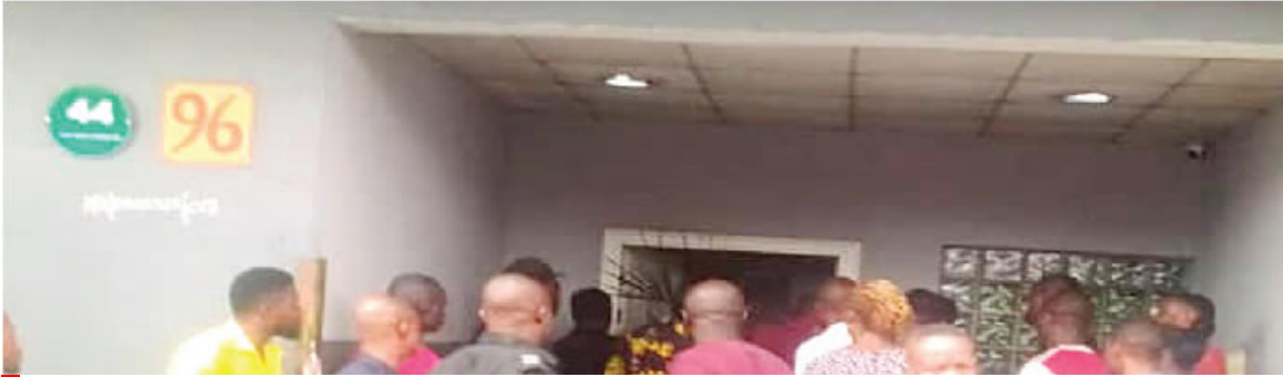
Scene of the incident