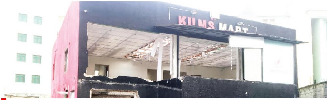
Scene of the incident