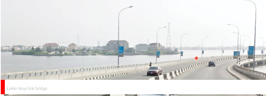
Lekki-Ikoyi link bridge