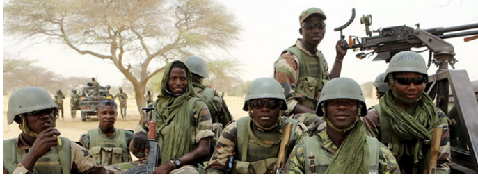
File: Nigerian troops