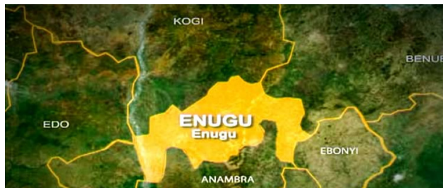
Map of Enugu State