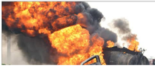
Scene of a tanker explosion.