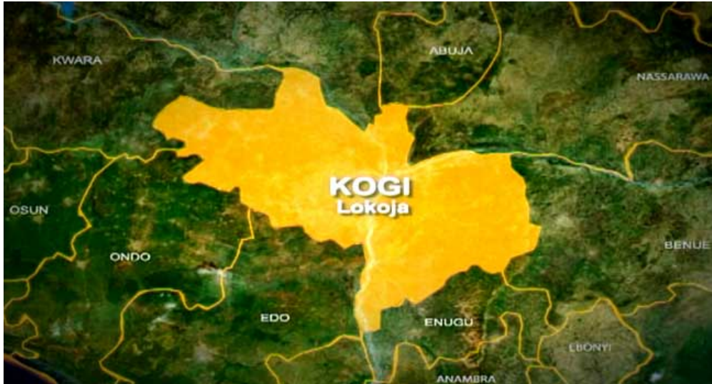
Map of Kogi State

No fewer than six persons, including a toddler, have been killed by a flood that sacked communities in the Ibaji Local Government Area of Kogi State.