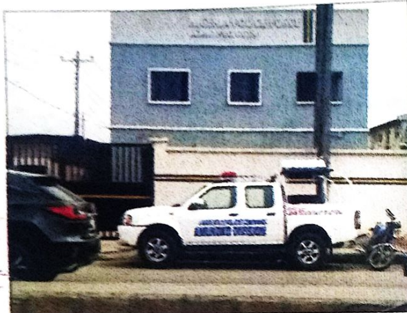
• The police station

It was learnt that the nearest police station was alerted and policemen detailed to the crime scene, engaged the armed robbers and arrested Ayinla during the operation on August 26, 2022.