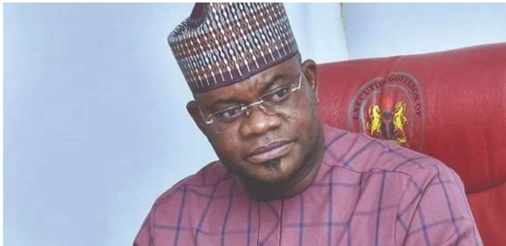
Kogi State Governor Yahaya Bello

The Kogi State Government has ordered a probe of the mining site that collapsed and killed two persons identified simply as, Amodu and Attah, at Ika-Ogboyaga, in the Ankpa Local Government Area of the state.