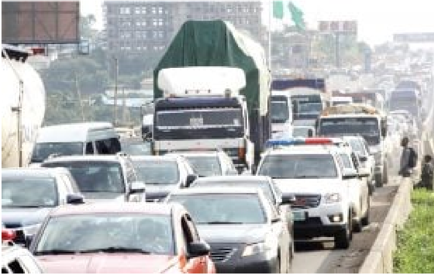
The Lagos-Ibadan Expressway traffic

Three yet-to-be-identified persons have lost their lives during an accident that injured four other persons in Oniworo, along the Lagos Ibadan Expressway, on Sunday.