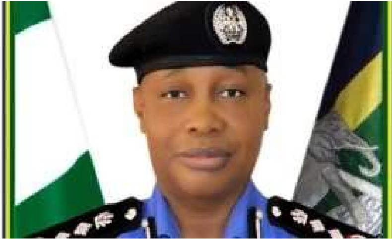
Inspector-General of Police, Usman Baba

No fewer than three people have been killed and many others, including women and children, abducted, in a series of attacks by suspected kidnappers in Taraba, Katsina and Niger states.