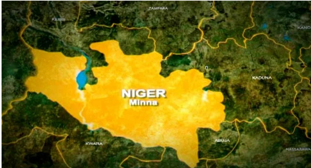
Map of Niger state

The number of security operatives killed by suspected bandits in Niger State has increased with more bodies reportedly discovered in the bush.