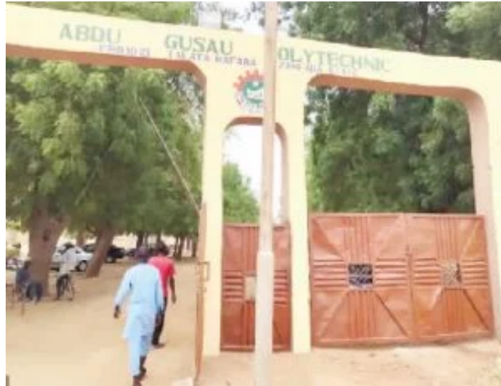
Abdu Gusau Polytechnic